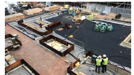
Floradrain® FD 40-E is the core element of the build-up. It was laid out under all green areas providing the plants with optimal water/air balance.