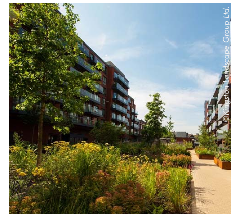
The inner podium courtyard is built on top of the underground garage.