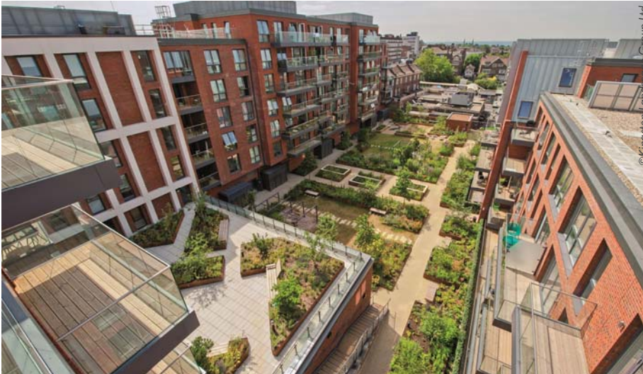
View from above onto the inner courtyard of the new Streatham Hill residential development.