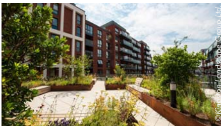
Benches integrated into the planters as well as special seating areas are provided for the residents to enjoy a green oasis just a stone's throw away from a thriving high street in a London suburb.