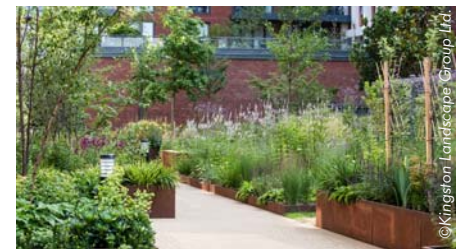
Trees, evergreen shrubs as well as blooming perennials create an attractive and lush plant mixture.